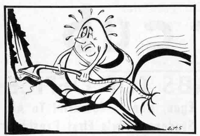
MORE THAN A ONE MAN JOB